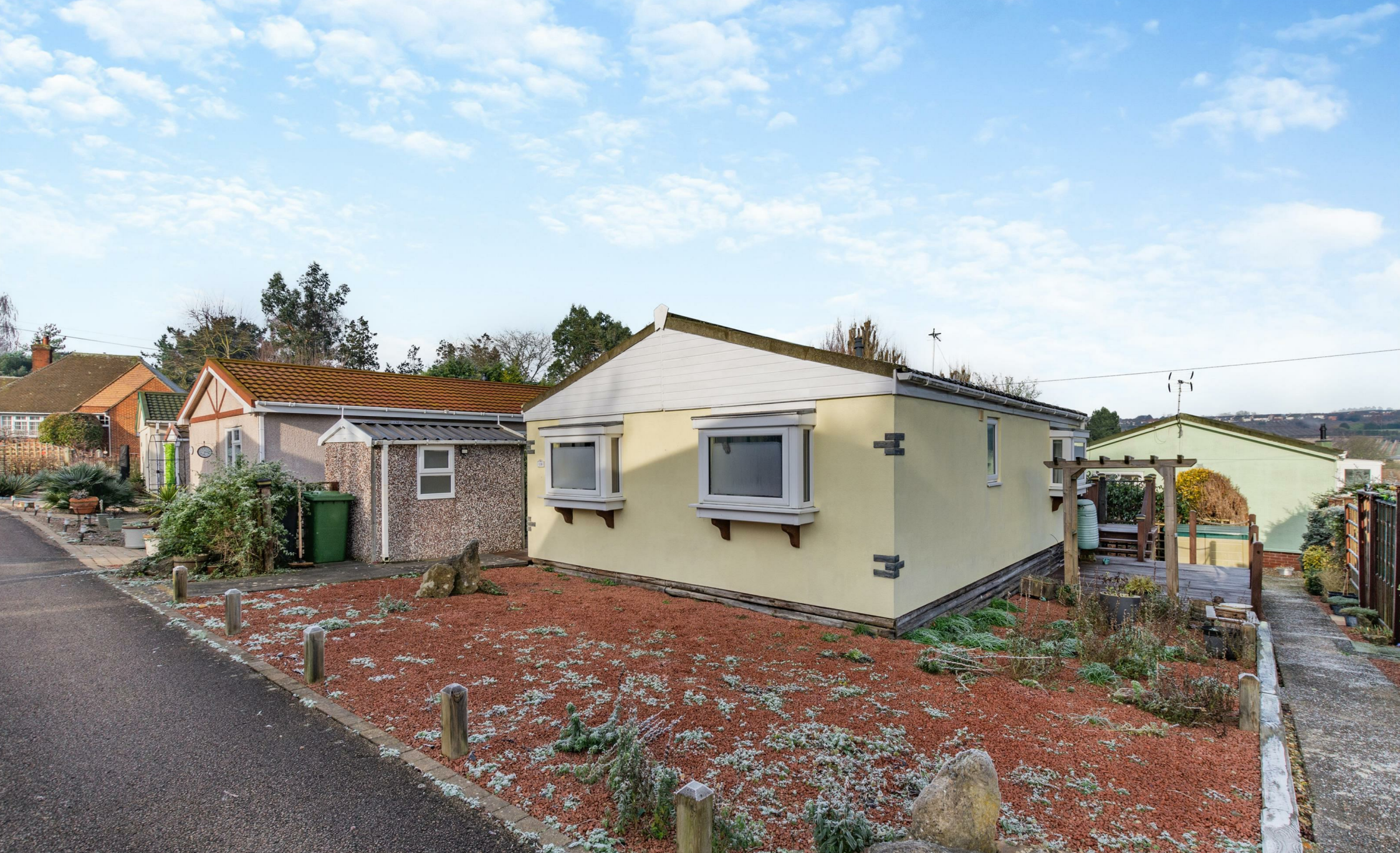
Hartridge Farm Mobilehome Park, Lower Road, East Farleigh, ME15 0JR Price £165,000